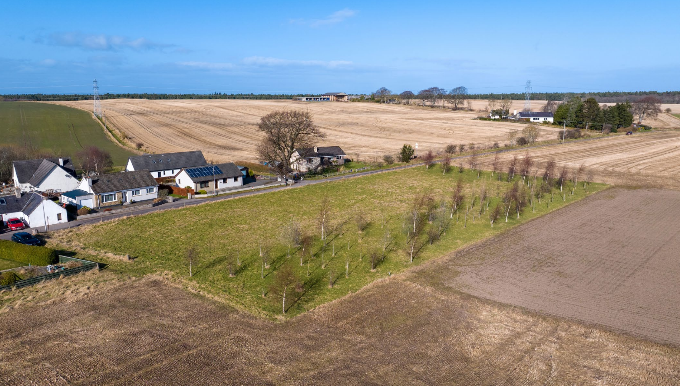
Three Building Plots with Full Planning Permission in Dyke, Moray